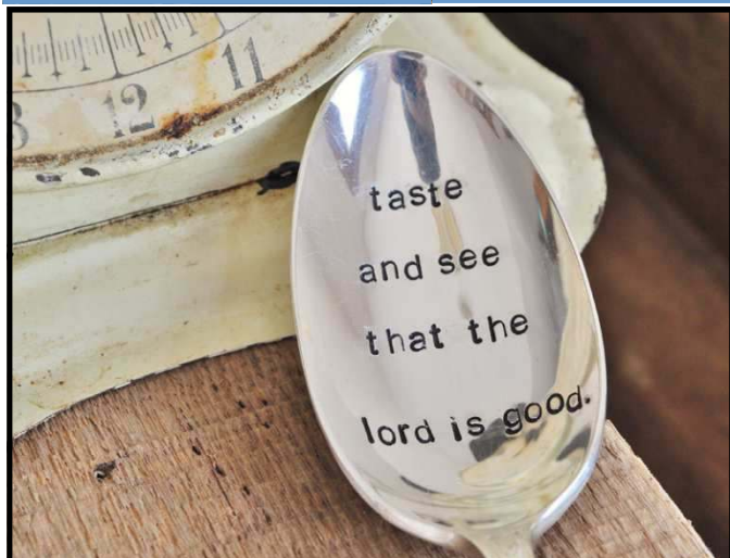
Please register by July 14 by calling 419-925-7625