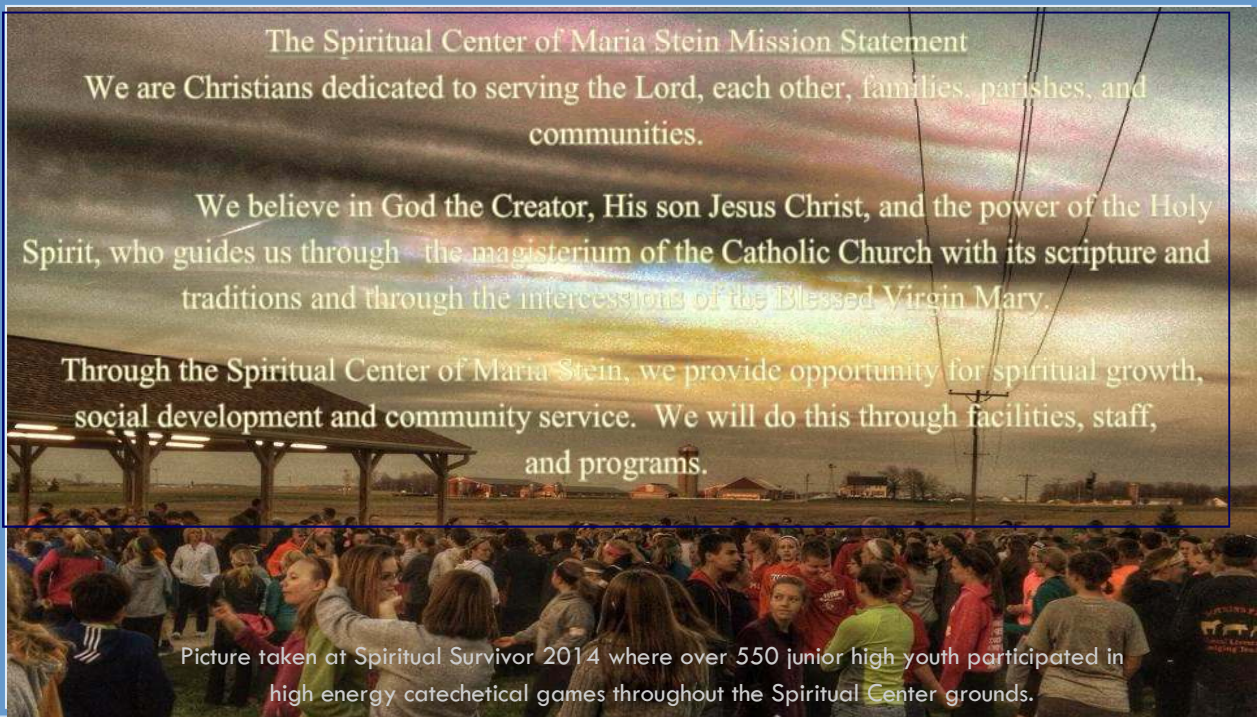
Picture taken at Spiritual Survivor 2014 where over 550 junior high youth participated in high energy catechetical games throughout the Spiritual Center grounds.

Visit our website at www.spiritualcenter.net