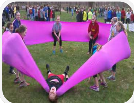
Nearly 600 area junior high youth participated in "Spiritual Survivor" April 17. The event, sponsored by Northern Network Youth Ministers was a huge success! Look on the Spiritual Center's Facebook page for more fun pictures!